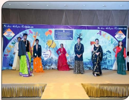
'Fashion show': Participant Teams from 26 Colleges, Mumbai