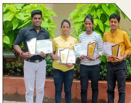
Winners of the 3 km race at SNDTWU Minithon Road Race - "RUN FOR EMPOWERMENT". 14 th August 2022.