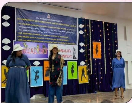
Performance by BSc faculty