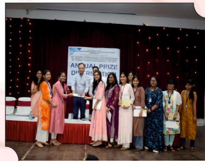
Theatre actors awarded for their commendable performances.