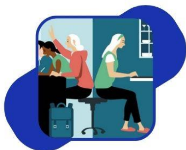
SKILL BASED EDUCATION