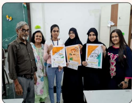
In house - Poster Making competition under Azadi ka Amrit Mahotsav. Theme: Celebrating Empowerment. 3 rd August 2022