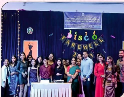
TYBCA and SYMSc CS student. Theme - : "Disco". 25 th April 2023.