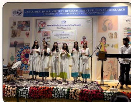
Yuva Mahotsav Intercollegiate Competition, SNDT Pune. Prizes received in Fine Arts, Literary and Music. 30 th September and 1 st October 2022