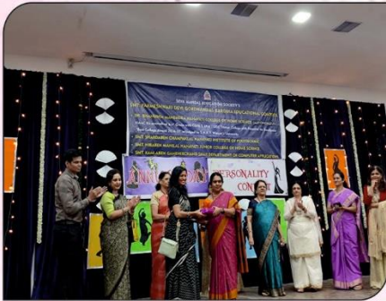
Felicitation of the Personality Contest Judges.