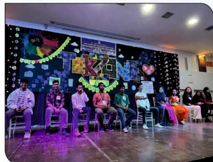
Participants of Ms. & Mr. Tekzone 2023 Event