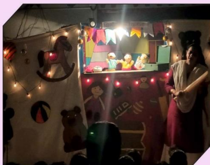
Puppet Show For Children at BalMela