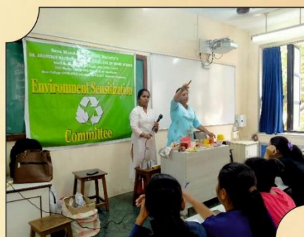
Workshop: Preparation of organic colours at home. NGO Paryavaran Dakshata Mandal for FYBCA students. 4 th March 2023