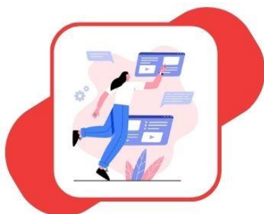
INDIAN KNOWLEDGE SYSTEMS