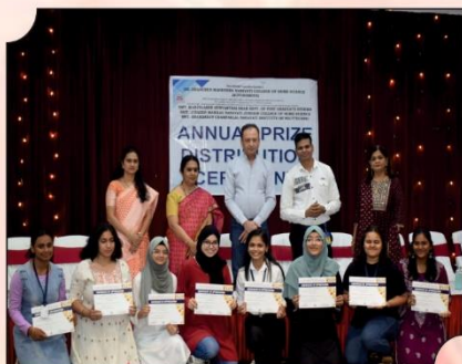
Student editorial team of BMN Bulletin