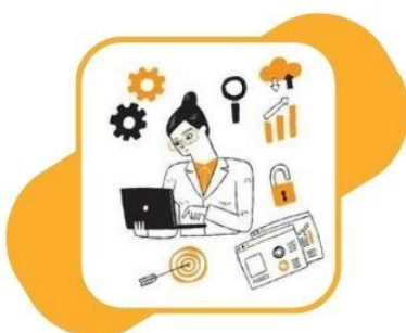
RESEARCH BASED LEARNING