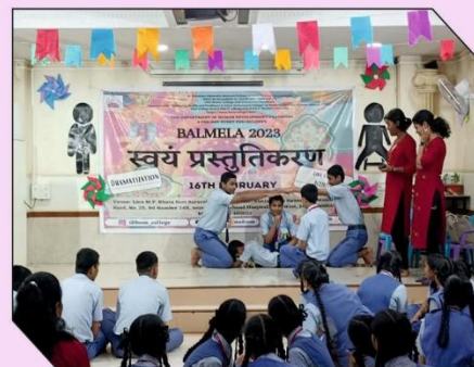
Dramatisation on Presentation and Motivation for adolescent students