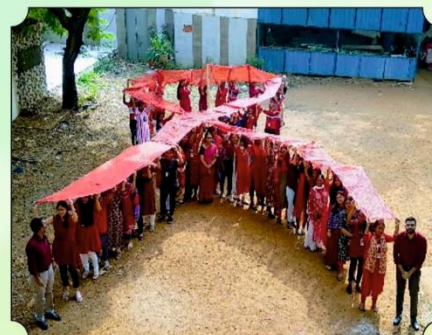
Human chain formed by staff and students to spread awareness about AIDS. 6 th December 2022