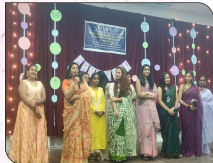
TYBSc students. Theme - : "Shades of Pastel". 21 st March 2023.