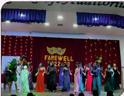
Postgraduate students (MSc CND, MSc RM [THM], PGDSSFN and PGDECE). Theme: "Masquerade". 16 th March 2023.