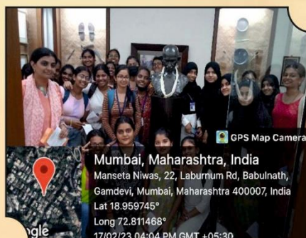
Visit to Mani Bhavan. 17 th February 2023