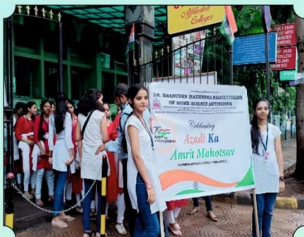
A rally on account of “Azadi ka Amrut Mahotsav”. 13 th August 2022