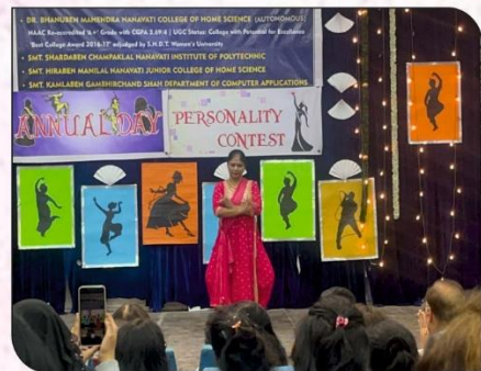
Classical Dance by BCA faculty.