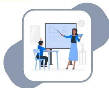
INNOVATIVE TEACHING AND LEARNING