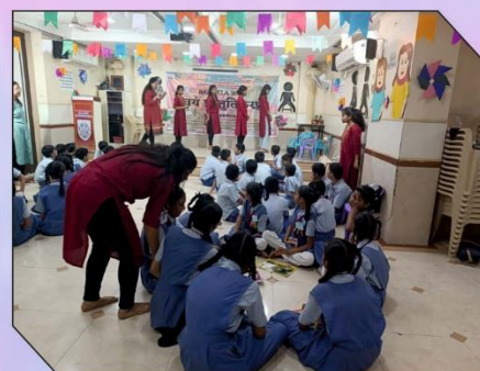
Workshop and Activities to Develop Presentation Skills