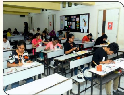
Coffee Painting at Fine Arts event