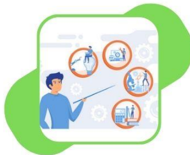
MULTI DISCIPLINARY PROGRAMMES