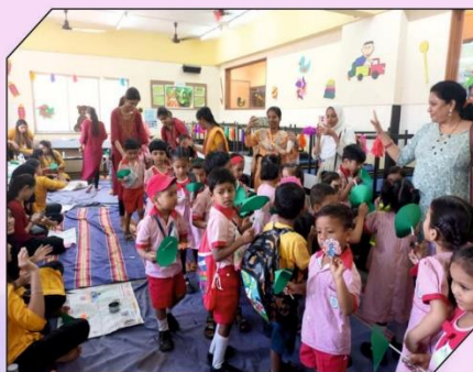
Live Activities for students from various Schools