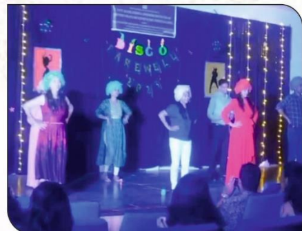
BCA Teachers' Performance. 25 th April 2023.