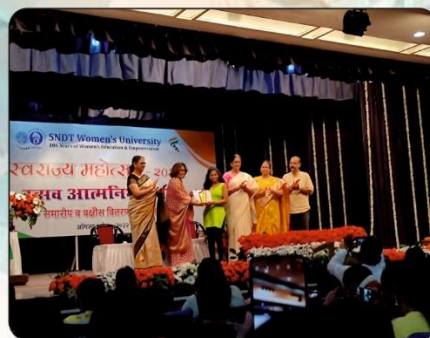
SNDTWU Churchgate: Azadi ka Amrit Mahotsav. Prizes received in Fine Arts & Literary Competition. 18 th August 2022