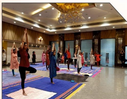
Yoga Workshop for Teaching Staff on International Day of Yoga by the Sports and NSS unit in collaboration with District Sports Office, Government of Maharashtra. 21 st June 2022