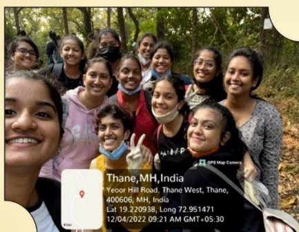
Students and staff participated in Yeor Forest (Thane) clean up drive with NGO Muse Foundation. 4 th December 2022