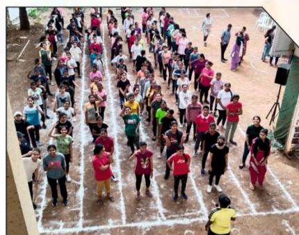
3 Day Annual Sports Festival 2022-2023 from 5 th to 7 th January 2023