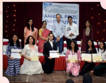
Western vocal singers with their certificates