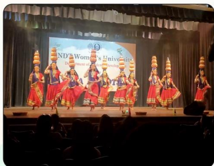
Yuva Mahotsav Intercollegiate Competition, SNDT Churchgate. Prizes received in Theatre Events. 22 nd and 23 rd September 2022