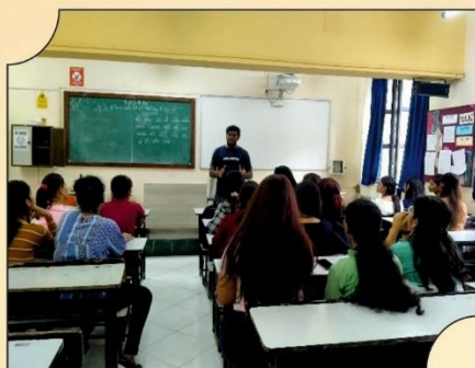
Induction of FYBCA and FYB.Sc students in Ecoclub by NGO United way Mumbai. 18 th August 2022