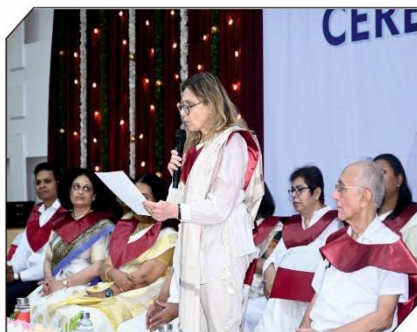
Pronouncement of the Degrees