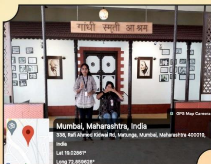
Gandhi Jayanti Week Celebrations. 29 th September 2022