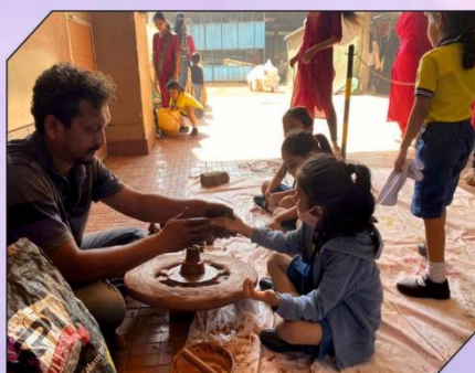
Hands on experience With A Potter