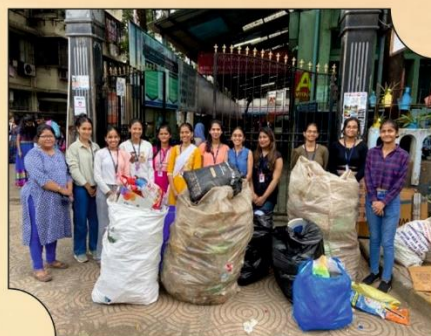
Plastic and Dry collection Drive by Eco Club Girls with NGO United way. 26 th November 2022