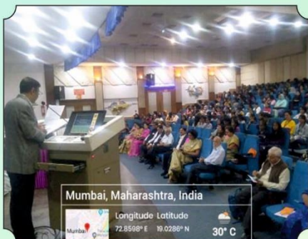
“Women's Empowerment” Seminar in Collaboration with Rotary Club of Bombay East. 23 rd November 2022